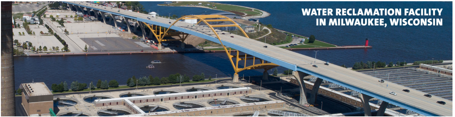
WATER RECLAMATION FACILITY IN MILWAUKEE, WISCONSIN